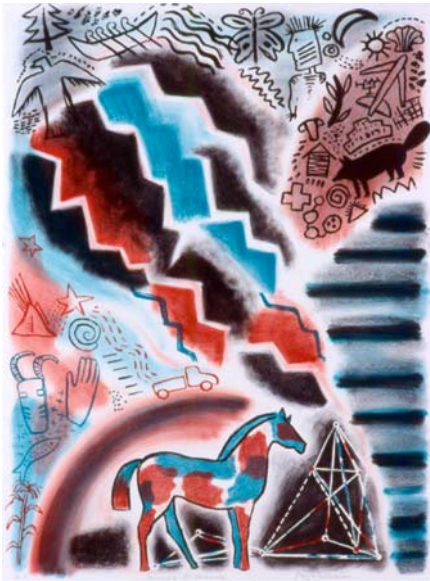
Winds of Change , lithograph, ca.1992, 30 x 22.5"

Arts Commission for a collection they put together to travel to public schools around the state. The work makes reference to local animals and environmental issues. The title pays homage to the Suquamish leader, Chief Seattle, after which the largest city in the state is named.