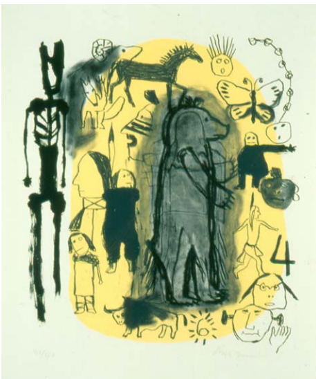
Sticky Mouth , lithograph, 1997, 21.5 x 19"

bold composition was made as a commission to celebrate the Olympics in Salt Lake City.