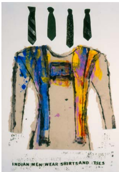
Indian Men Wear Shirts and Ties , lithograph, pulp paper painting, 1997, 41.75 x 29.25" Donated by Rutgers Center for Innovative Print and Paper

across the composition, Quick-to-See Smith arranged the text above and below the images. She is letting the viewer know that indigenous people have been on this continent for millennia creating American art. Any art history of the American continents celebrates our place in the art world over thousands of years.