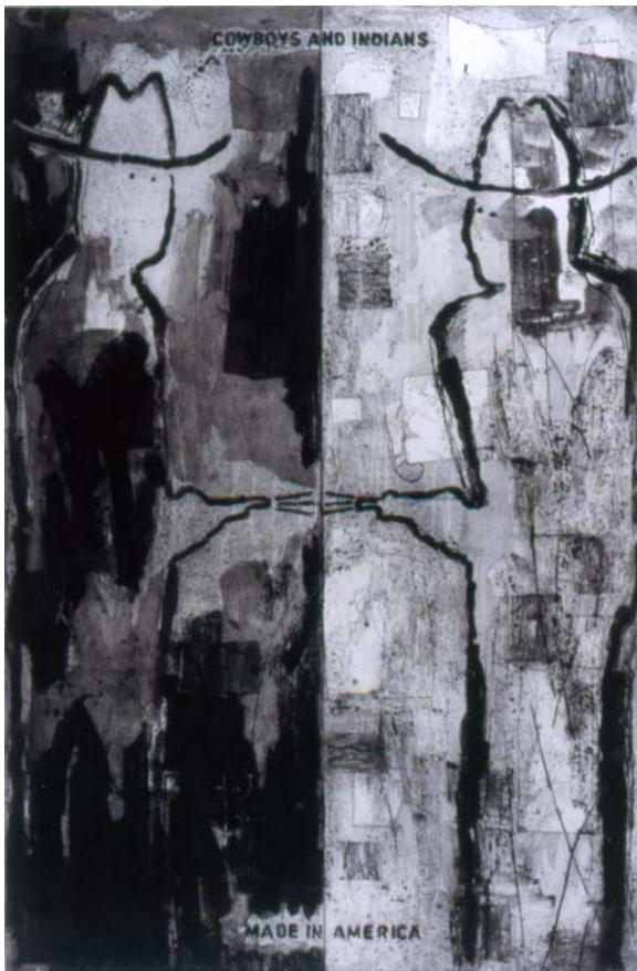
Cowboys and Indians , collagraph, 1995, 77.75 x 50.5"

explores the way in which the American mythology about Indians creates alarming and violent stereotypes. In this lithograph, two figures in cowboy hats shoot it out. A sensitive viewer is struck by the fact that “Cowboys and Indians” is a game that American children play. That game makes a history of violence and genocide against indigenous human beings seem both normal and acceptable. The vacant mask-like faces with the small round eyes and the guns, pointed and fired across the center of the piece, are frightening. Quick-to-See Smith makes viewers aware that this is a game that no one should be taught to play.