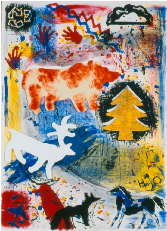
Ode to Chief Seattle , lithograph, ca. 1991, 30 x 22.25"

Jaune Quick-to-See Smith is also a skilled printmaker as is shown by the large number of prints in the Missoula Art Museum Contemporary American Indian Art Collection. Indeed, the Missoula Art Museum has the largest number of her prints in a museum collection anywhere in the country, thanks to the artist's commitment to donating one print from of every edition she has made. These prints include lithographs, collagraphs, a serigraph, and other editioned works, as well as one monotype. The earliest of these works dates from 1991 and the most recent was done in 2005. The range of these works reveals Quick-to-See Smith's ability to address multiple subjects in her work as well as her ability to use a variety of strategies for visual representation. Six of the works depend almost entirely on visual images rather than on a mixture of language and text, and this is a strategy she returns to over time.