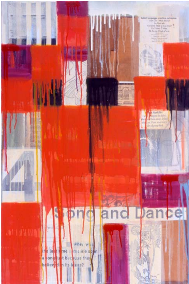
Song and Dance , oil, mixed media on canvas, 2003, 36.25 x 4.24"