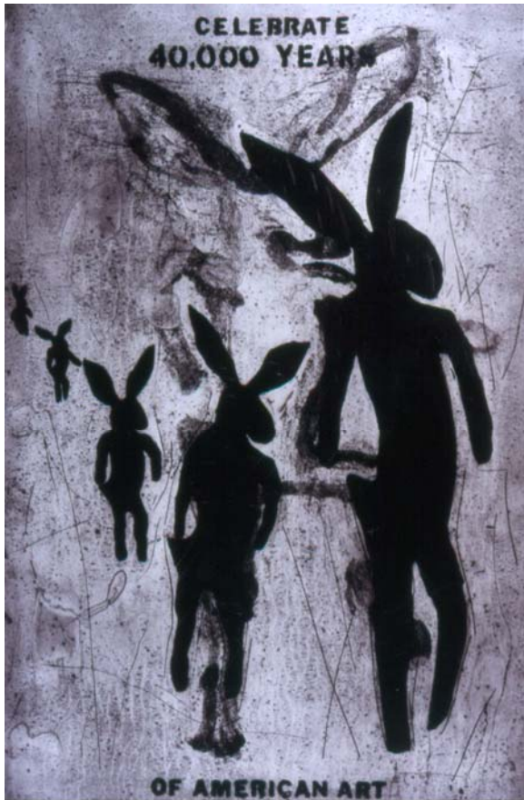
Celebrate 40,000 Years of American Art , collagraph, 1995, 71.5 x 47.5"

bear and Quick-to-See Smith relates, "...the work makes reference to traditional beliefs about the transformation between human and bear that are based on human qualities seen in standing bears." The petroglyph-like figure at the left side of the composition shows this transformation to human, but retains the bear's ears. The yellow glow which illuminates the center group of images focuses the eye so that it moves between the ghostly figure of the transformed bear with an exposed rib cage at the left and the image of the standing bear with the drawings that surround it. This creates an interesting visual tension that gives the work a sense of movement between realities.